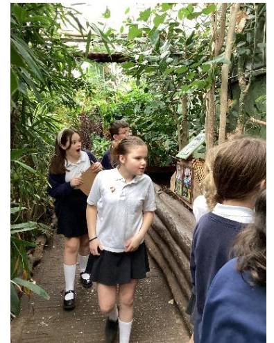
The Living Rainforest