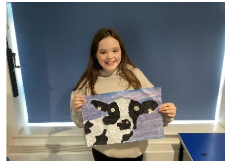
Collage in Art