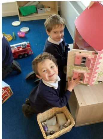
Small World Area