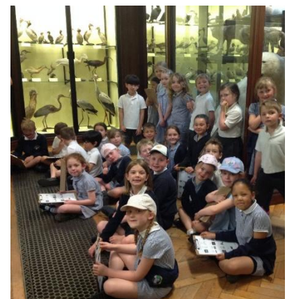
Tring Natural History Museum