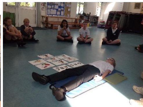
I.M.P.S First Aid