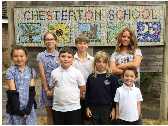
July's Resilient Runners