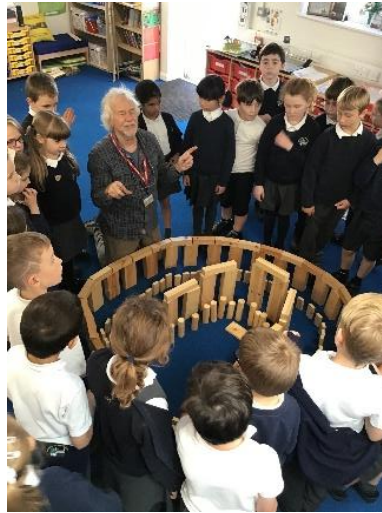
Stone Age Day