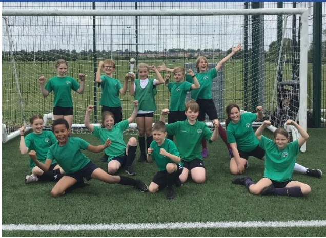
Sporting Penrose – Inter-House Football Champions