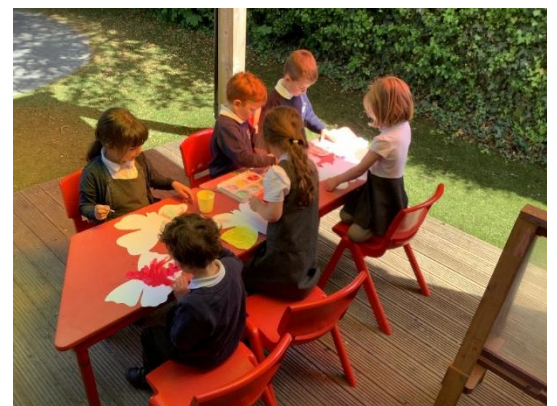
Symmetry on the Art table