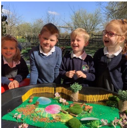
Making an Easter Garden