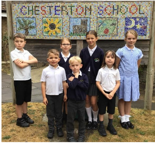
July's Marvellous Mathematicians