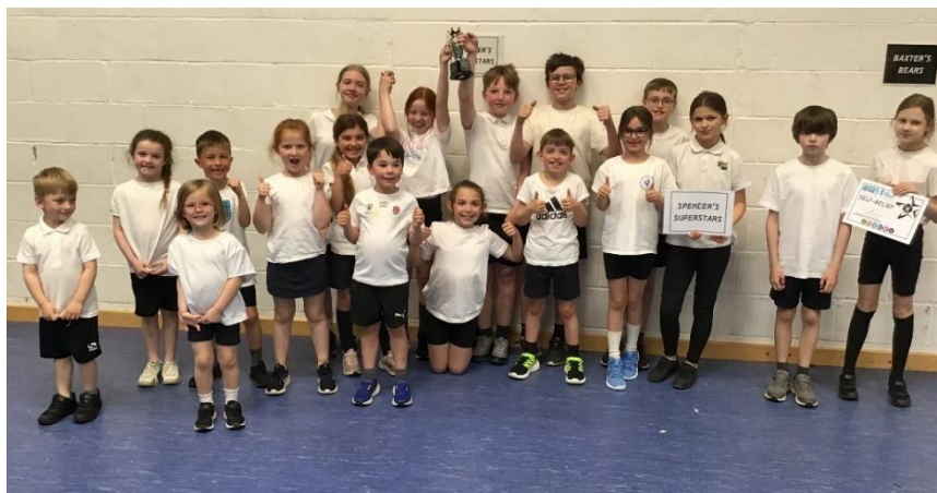
Spencer's Superstars – Sportshall Showdown Champions again!