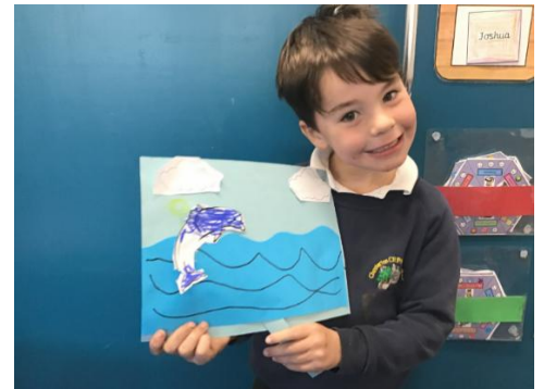
DT Pictures with Levers