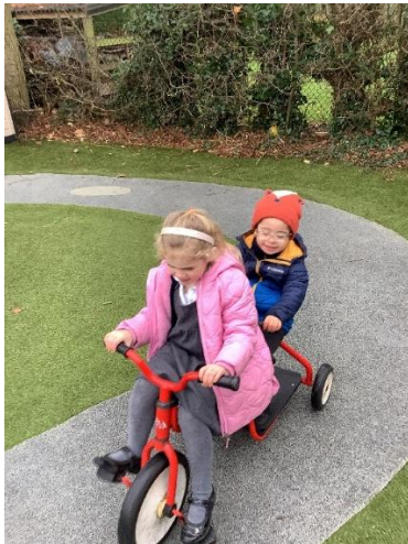
Fun on the trikes