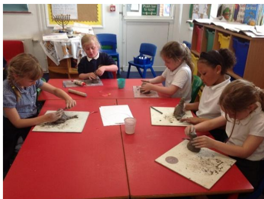
Sculpting Clay Aliens