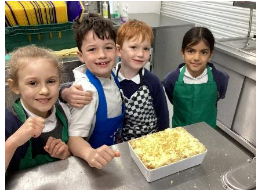
Cooking Cottage Pie