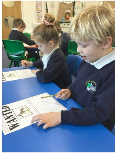
Big Bad Wolf Wanted Posters