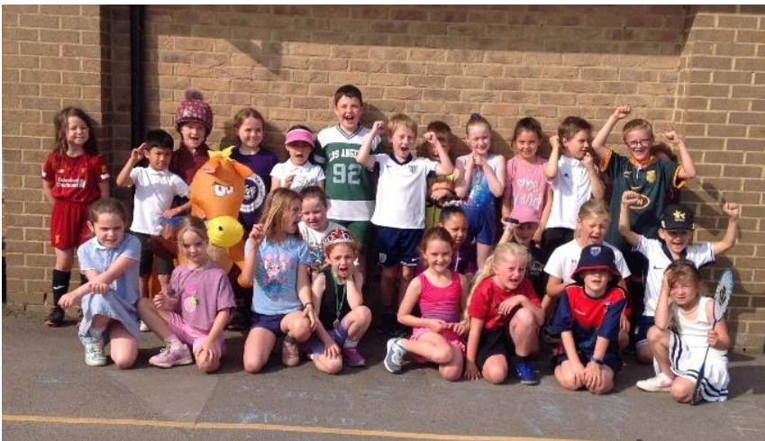
Outfits for School Sports Week