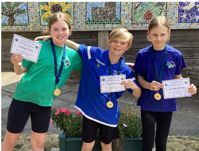
Hockey & Tennis Club