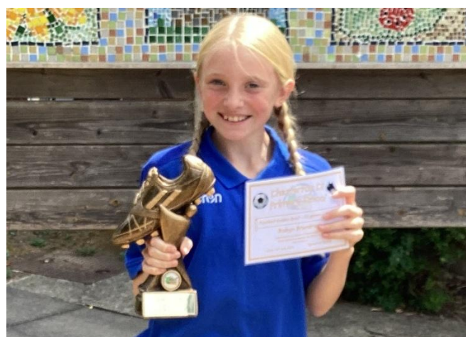
Golden Boot Winner