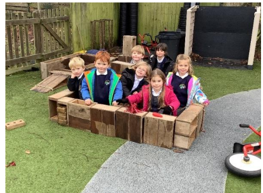
Fort building in the Maple garden