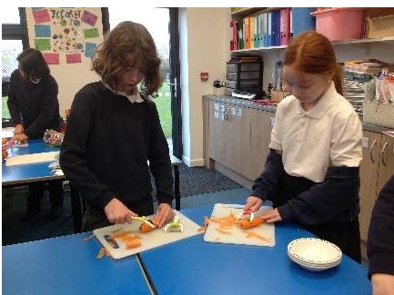
WWII Rationing Soup