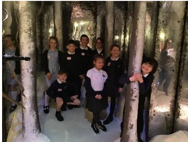
The magical Story Museum