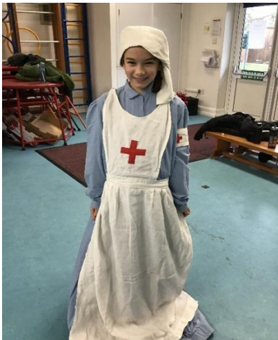
World War II Day