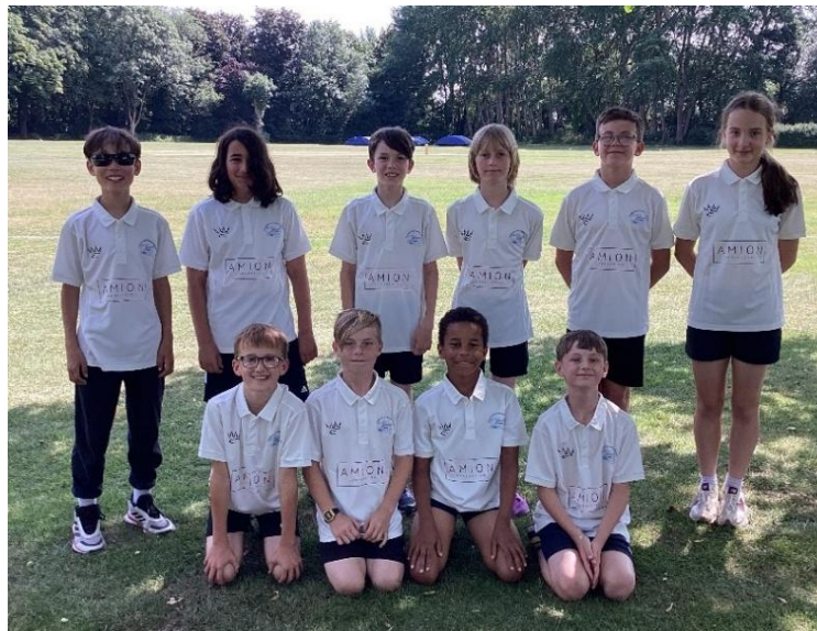
Our Year 5/6 cricket team at Bruern Abbey - sporting their new kit, kindly sponsored by Amion.