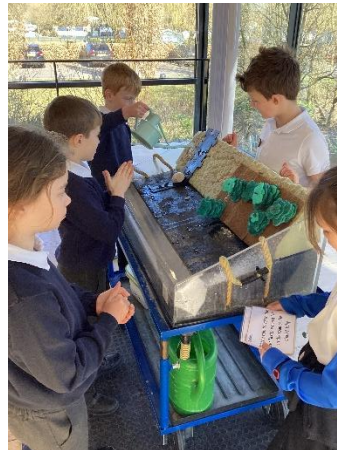
River & Rowing Museum