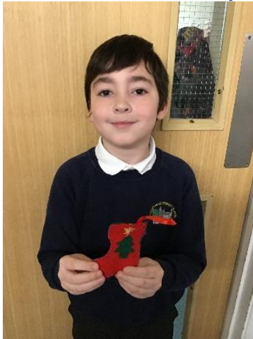
Sewing a stocking