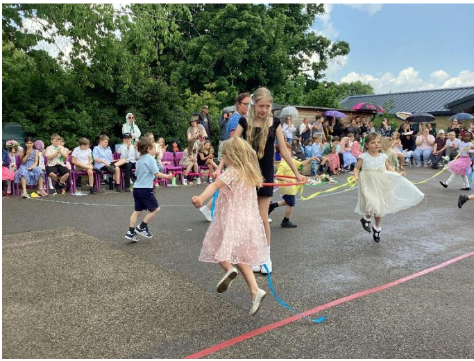
Maple Class' Circle Dance