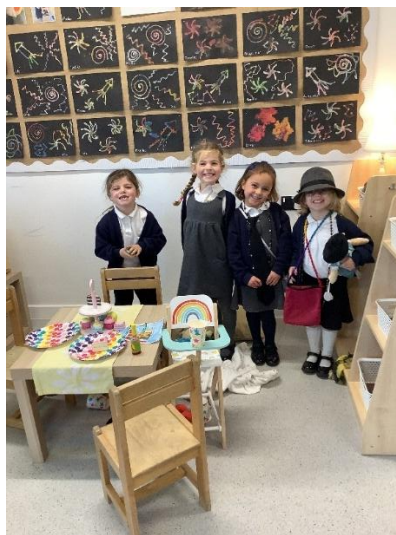
Dressing up for a birthday