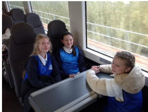
On the train to Oxford