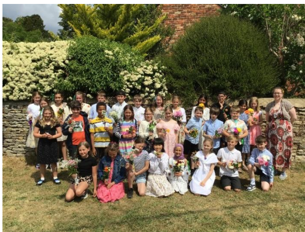
Rowan Class at the village green