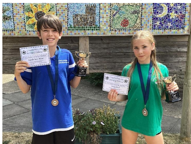
Footballers of the Year