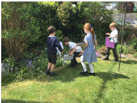
Learning about plants