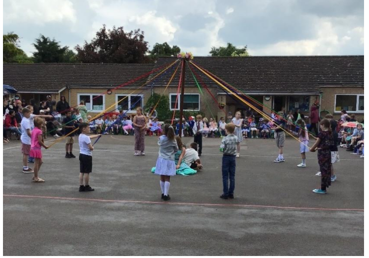
Hawthorn preparing to dance