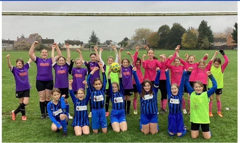
Year 5/6 Girls @ The Bicester School