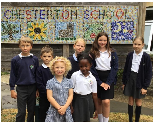
July's Handwriting Heroes