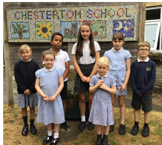
July's Magnificent Musicians